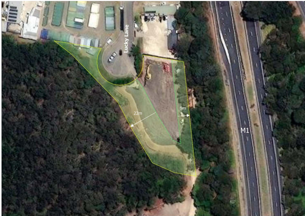
Figure 3. Showing the subject area of the planning proposal (yellow outline) and APZ / BAL-29 contour (green outline)